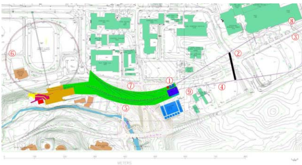
Figure 1: Current layout of Cornell's x-ray ERL.

The layout of Cornell's ERL is shown in Fig. 1. Several features have been developed further since the project description at [1]. An injector linac (1) produces 10-15MeV, 100mA beam with 77pC per 2-3ps long bunches for linac A (2). The beam is sent into a 2820GeV Turn Around (3) and is accelerated in linac B (4) to 5GeV for x-ray experiments in the undulator section (5). The beam is then returned through CESR (6) and the North undulator section (7) to linac A for deceleration, followed by a second Turn Around (8) at 2190GeV and by linac B, leading to the 10-15MeV beam dump at (9). This ERL is an extension to the